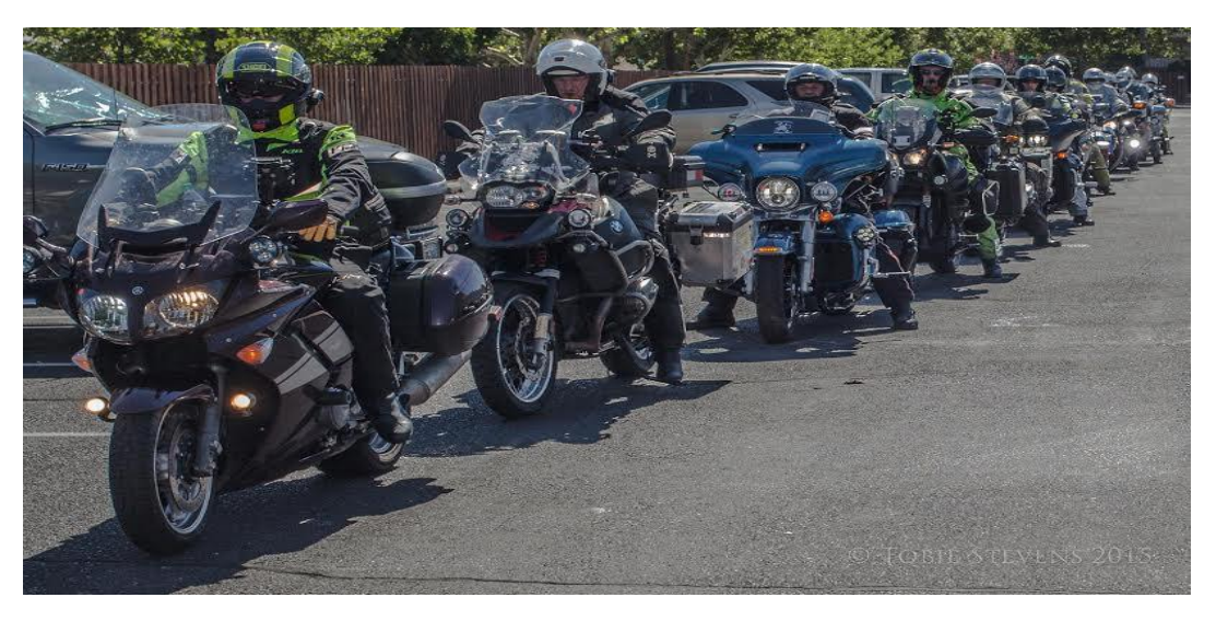
9:59:30 AM. READY... SET...