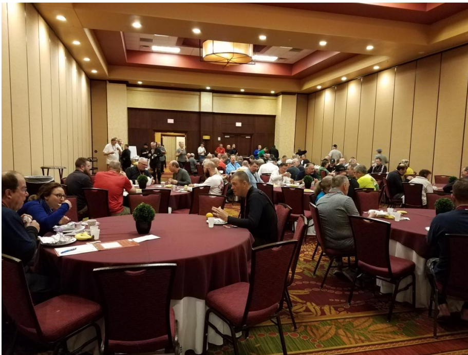
Rider's meeting at 4:00 a.m.