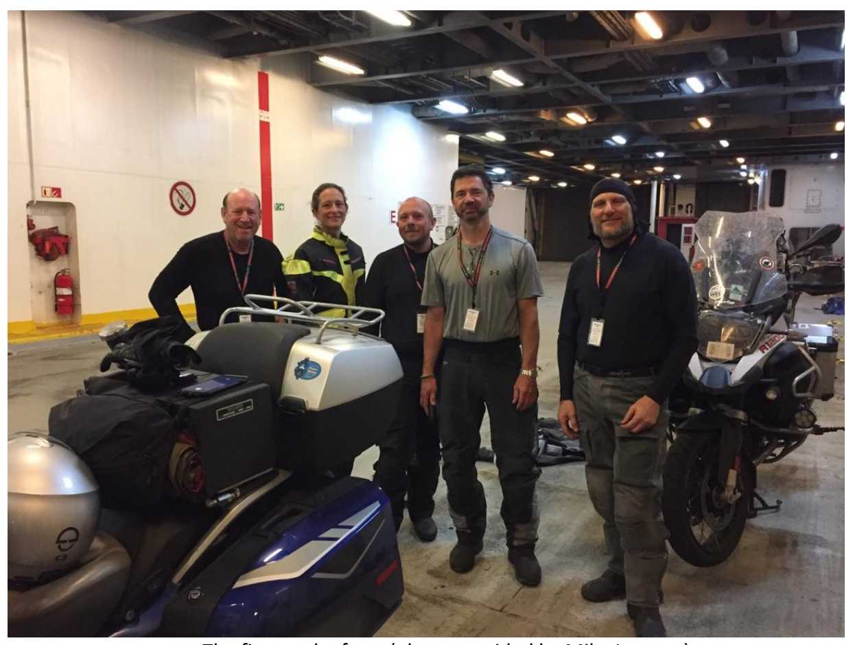
The five on the ferry.

The five selected different string sequences and multipliers, and not all of their plans worked perfectly, but listening to each of them recount the timing and effort needed to make the ferry, collect the needed strings, and get off the island in time to make it back to the finish was amazing. I will not steal their thunder and will leave the telling of those specific details to them.