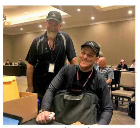
Team Almond Joy