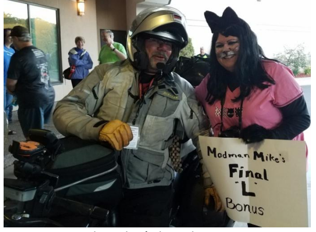
Results of a sudden gust of gravity.